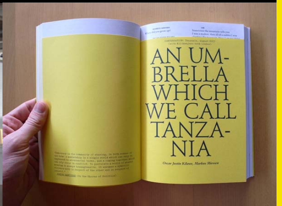
Above: Markus Miessen "The Violence of Participation - Zak Kyes"