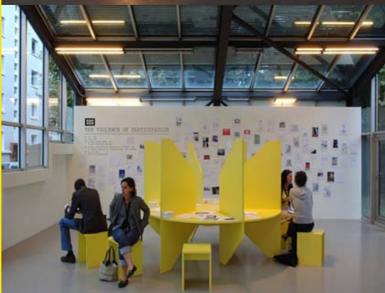
Above: Markus Miessen "The Violence of Participation"